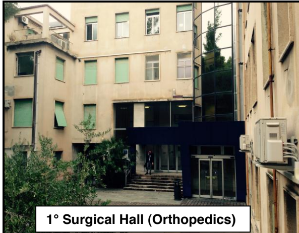
1° Surgical Hall (Orthopedics)

Azienda Ospedaliera – Ospedale S. Corona Divisione Ortopedia Via XXV Aprile, 82 17027 PIETRA LIGURE (SV) Italy www.ospedalesantacorona.it www.fondazione.it